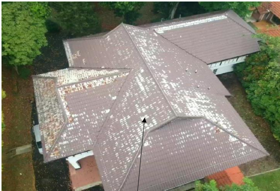
Poor roof condition