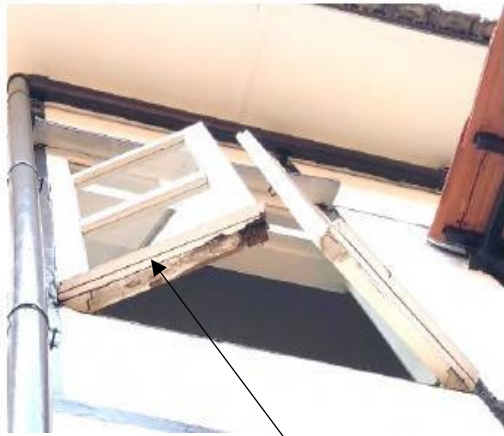
Wet rot on wooden window